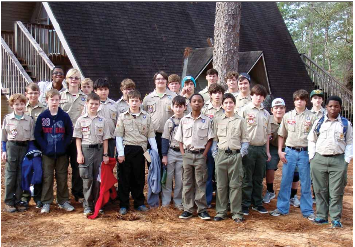
This page and the next: Camp Pinetreat campout

Troop 292 wants to thank Providence Presbyterian Church for being our charter organization. We also appreciate you allowing us to "mess up" your facilities from time to time. Thanks again for your support of the troop.